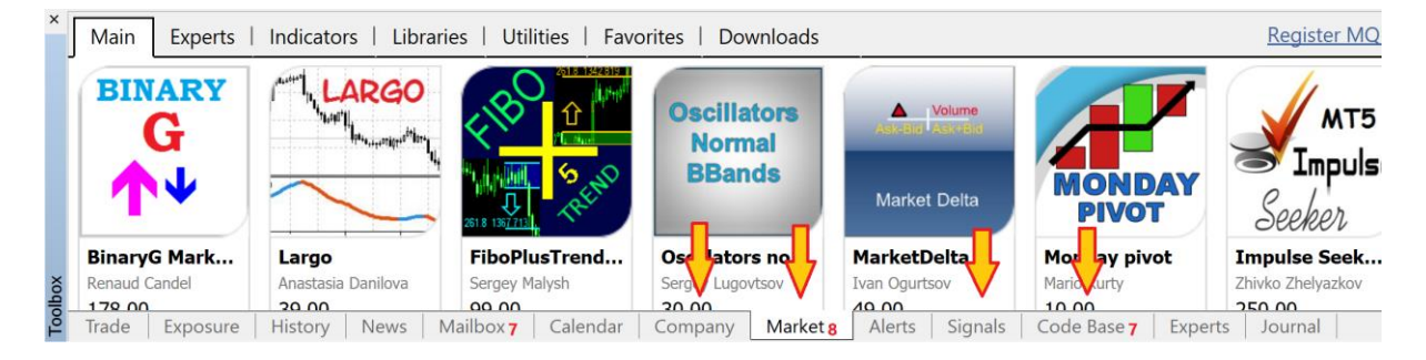
Numbers 1, 4, 6 and 7 can be access via your Toolbox window in your MT5.

Blog posts on MT4/5, trading and markets. Seems like nobody reads this stuff.