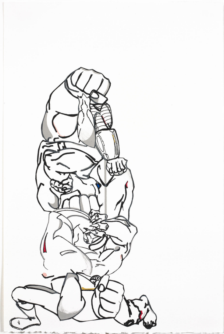
Above: Squat , six-color silkscreen on Revere paper, 22 1/2 x 15 in, Edition 12, published 2017.

Sprint , Squat , and Struggle —three screenprints by artist Orly Genger published at Island Press—signal energetic exertions of bodies in motion. In Sprint , contour shapes arranged end-to-end zig and zag across the frame. Squat presents a totemic form built of parts stacked and nested on each other in a carefully balanced tower. Lastly, Struggle conveys a tangle of dynamic forces at the composition's center, which pushes toward the edges of the sheet. This entire assembly remains aloft, resting on the toes of a stout foot planted on the lower border of the work. Such figurative elements, including this foot, clenched fists, bent legs, flexed arms and clawing fingers, appear throughout these compositions. These muscular anatomies are evocative of the idealized bodies upon which the canon of art history is built, passing from Ancient Greece through Renaissance Italy, and so forth. However, rather than the muscular 'superheroes' of art history, such as Polykleitos' Doryphoros or Bernini's David , Genger—with keen wit—turns to those of popular culture. The pages of comic books are her source and, specifically, the characters' exaggerated physiques as they accomplish astounding feats.