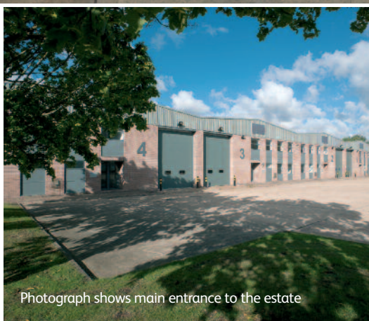
Photograph shows main entrance to the estate