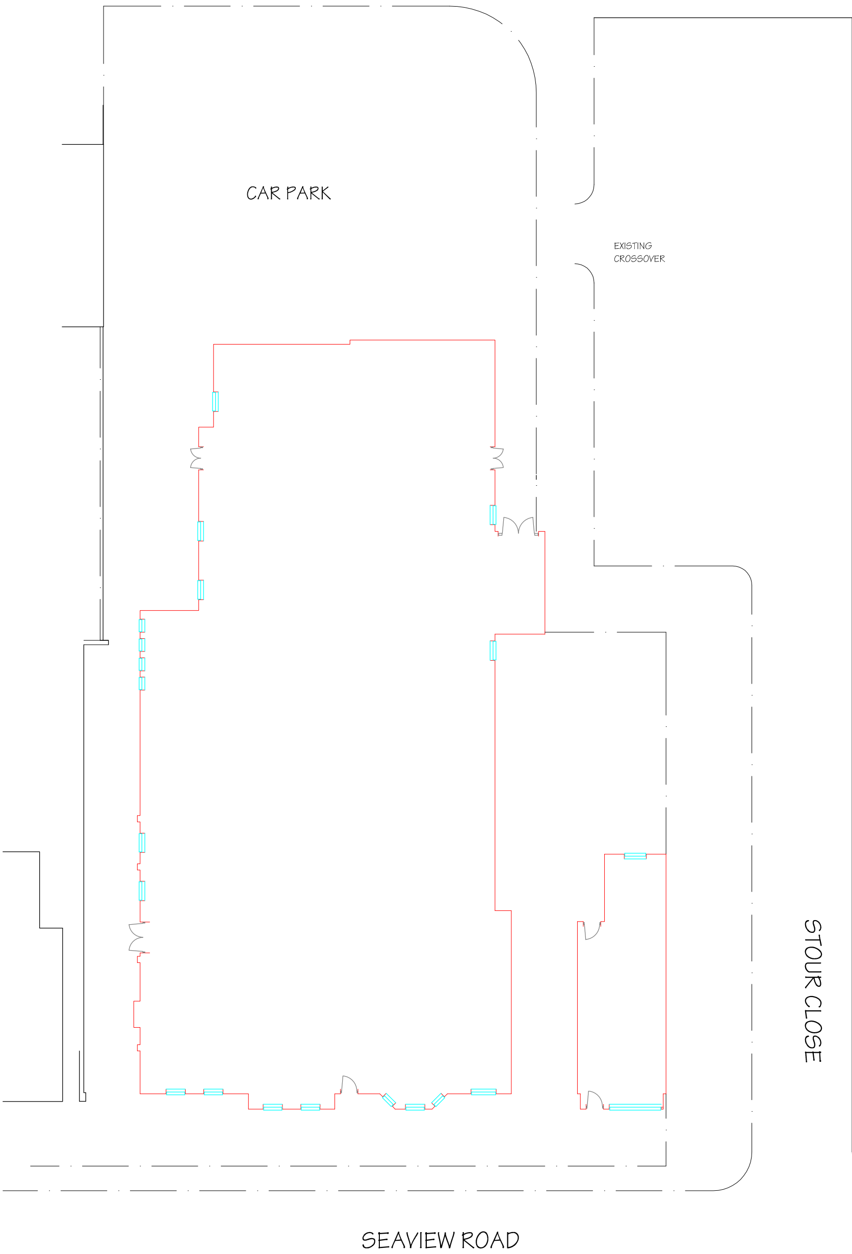
EXISTING SITE PLAN + BUILDING FOOTPRINT

ALL MATERIALS + WORKMANSHIP TO RELEVANT BRITISH STANDARDS + CODES OF PRACTICE THIS DRAWING IS COPYRIGHT AND IS ISSUED ON THE CONDITION THAT IT IS NOT REPRODUCED, COPIED, RETAINED, CHANGED OR DISCLOSED TO ANY OTHER PARTY EITHER WHOLLY OR IN PART WITHOUT THE WRITTEN CONSENT OF DESIGN ASSOCIATES