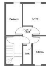
PROPOSED SECOND FLOOR PLAN