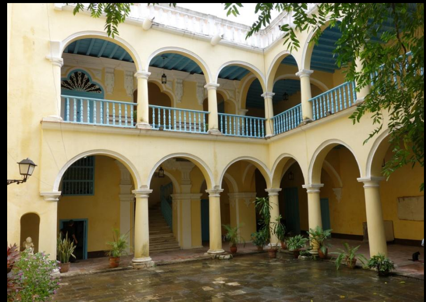
Casa de Obra Pío, 1685, 1793