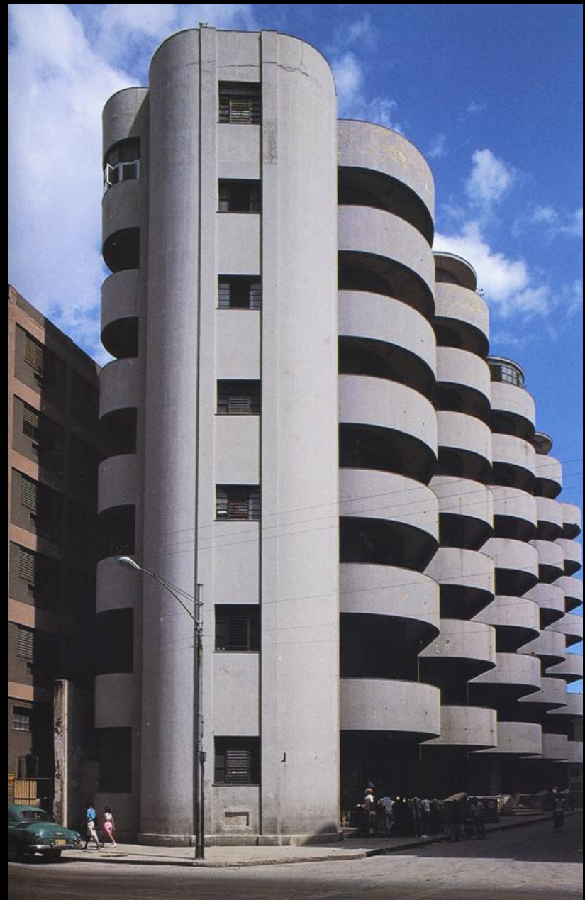
Manuel Copado, Solimar Building, 1944