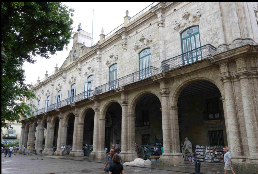
Palacio de los Capitanes Generales, 1776-1791