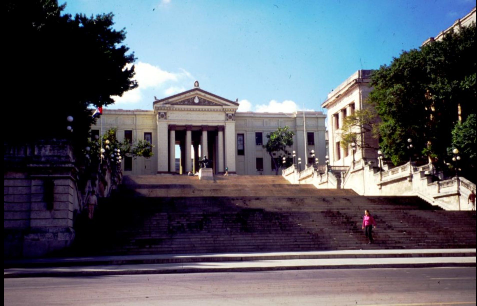
La Escalinata, University of Havana, 1927