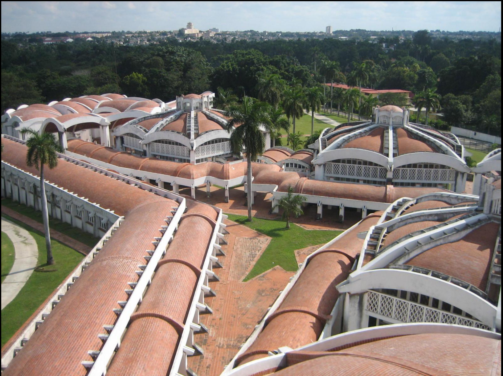
National School of Modern Dance, Ricardo Porro, Havana, 1961-1965