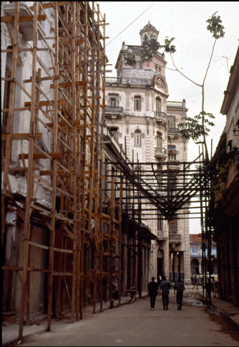
Old Havana, 1998