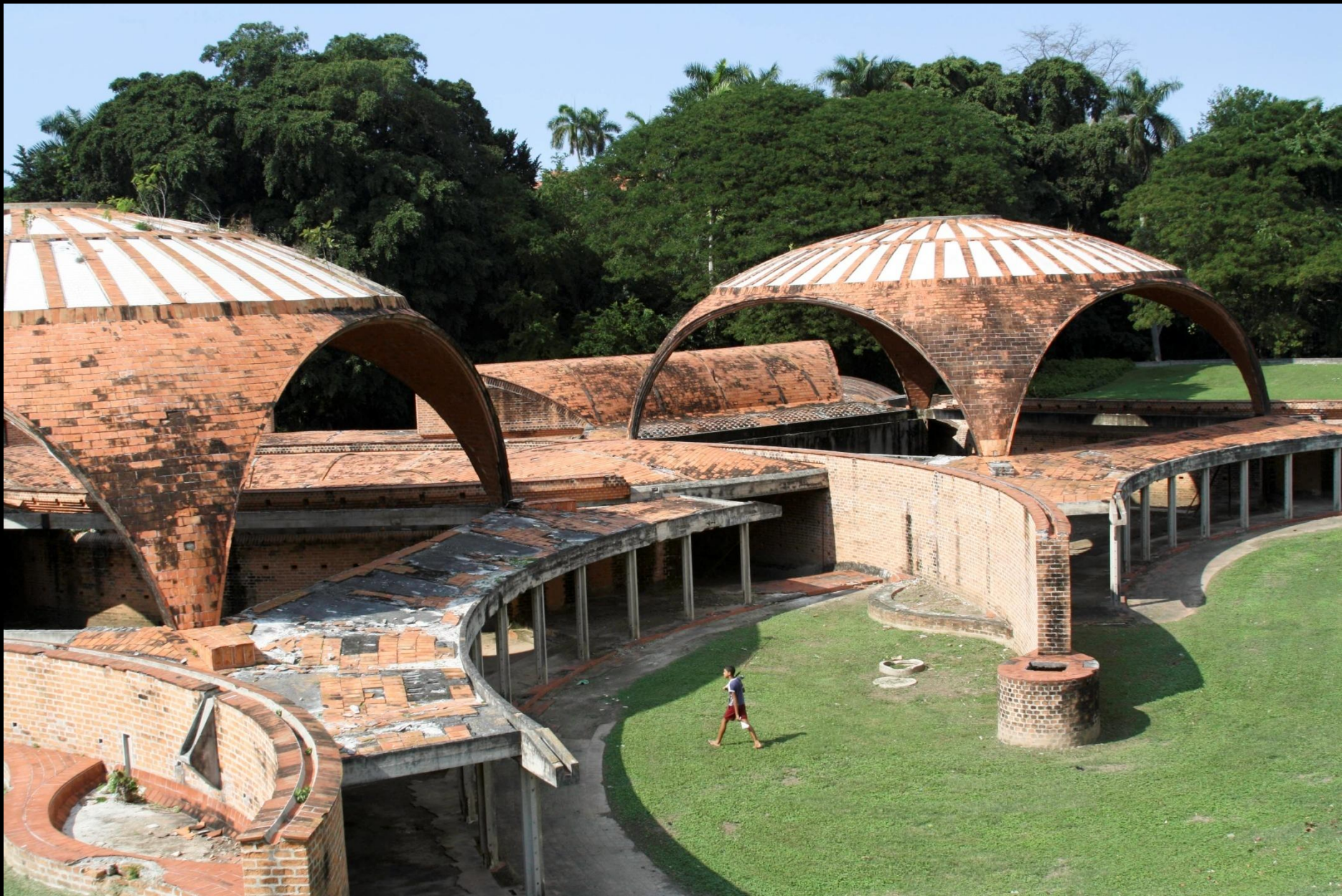
National School of Ballet, Vittorio Garatti, Havana, 1961-65