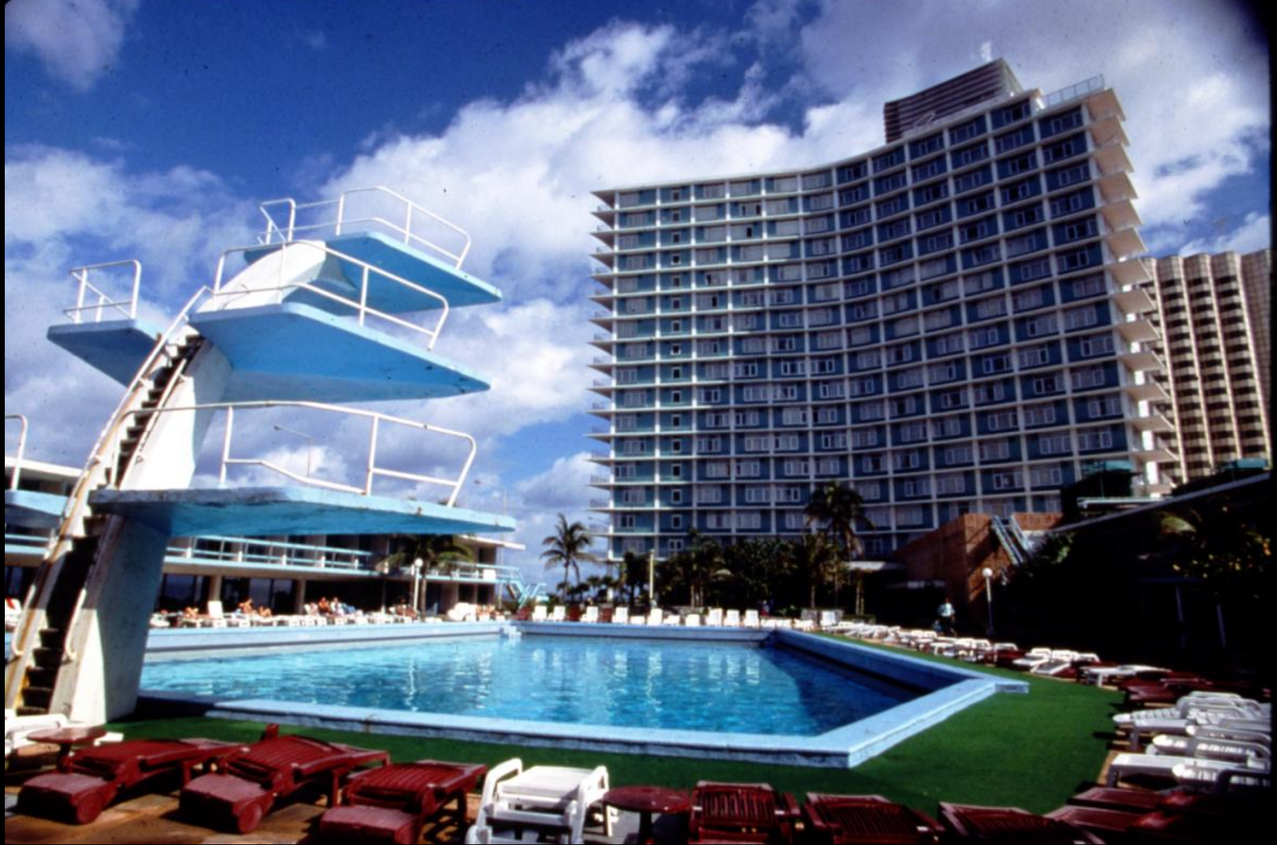
Habana Riviera Hotel, Polevitsky, Johnson & Associates, 1957