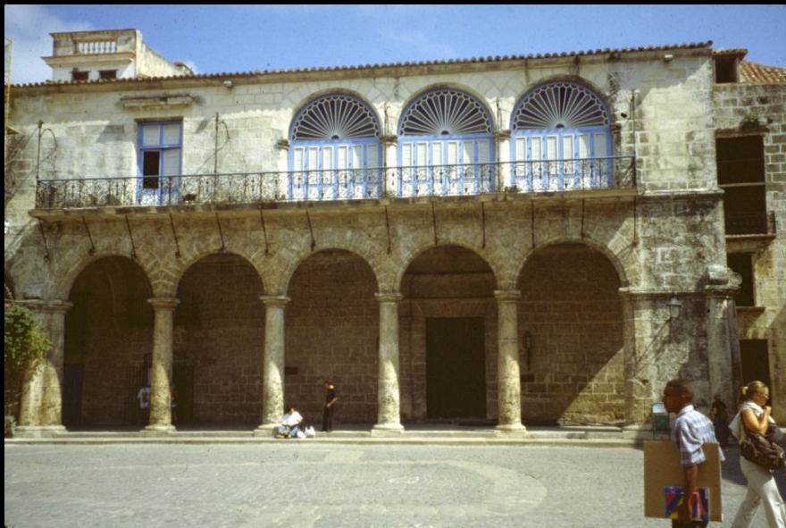
Casa de los Marqueses de Arcos, 1740