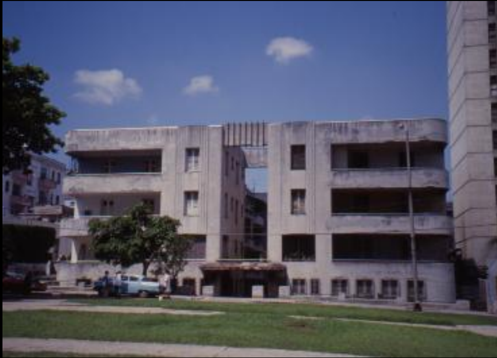
Emilio de Soto, Santeiro Apartments, Havana, 1937