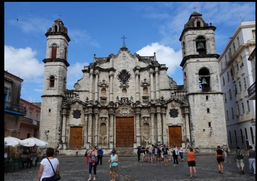
Havana Cathedral, 1748-1777