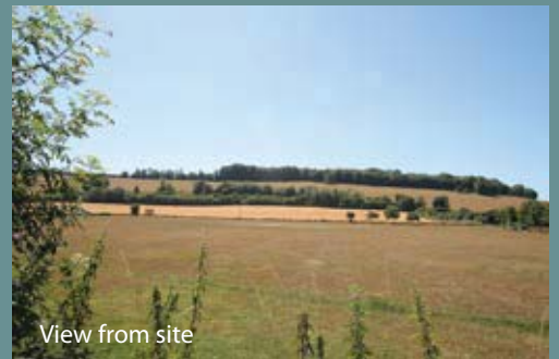
View from site

A stunning development site in a favoured Dorset village enjoying glorious rural views.