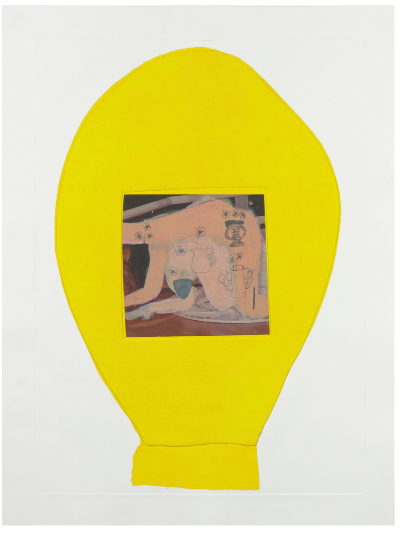
Above: Golden G: Flowers, Intaglio on polar fleece chine collé with archival inkjet and collagraph insert, 34 1/2 \times 26 1/4 in, Edition 12, published 2016.

Golden G brings the redactions into relief. The dimensional frames were created by affixing cut fleece shapes to the paper and printing on top of them. They recall the amorphous, ghostly bodices of the Inglett show, and