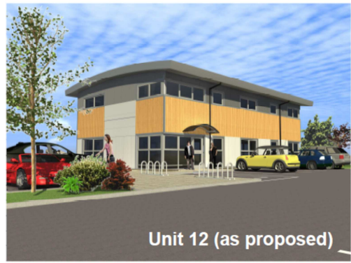
Unit 12 (as proposed)