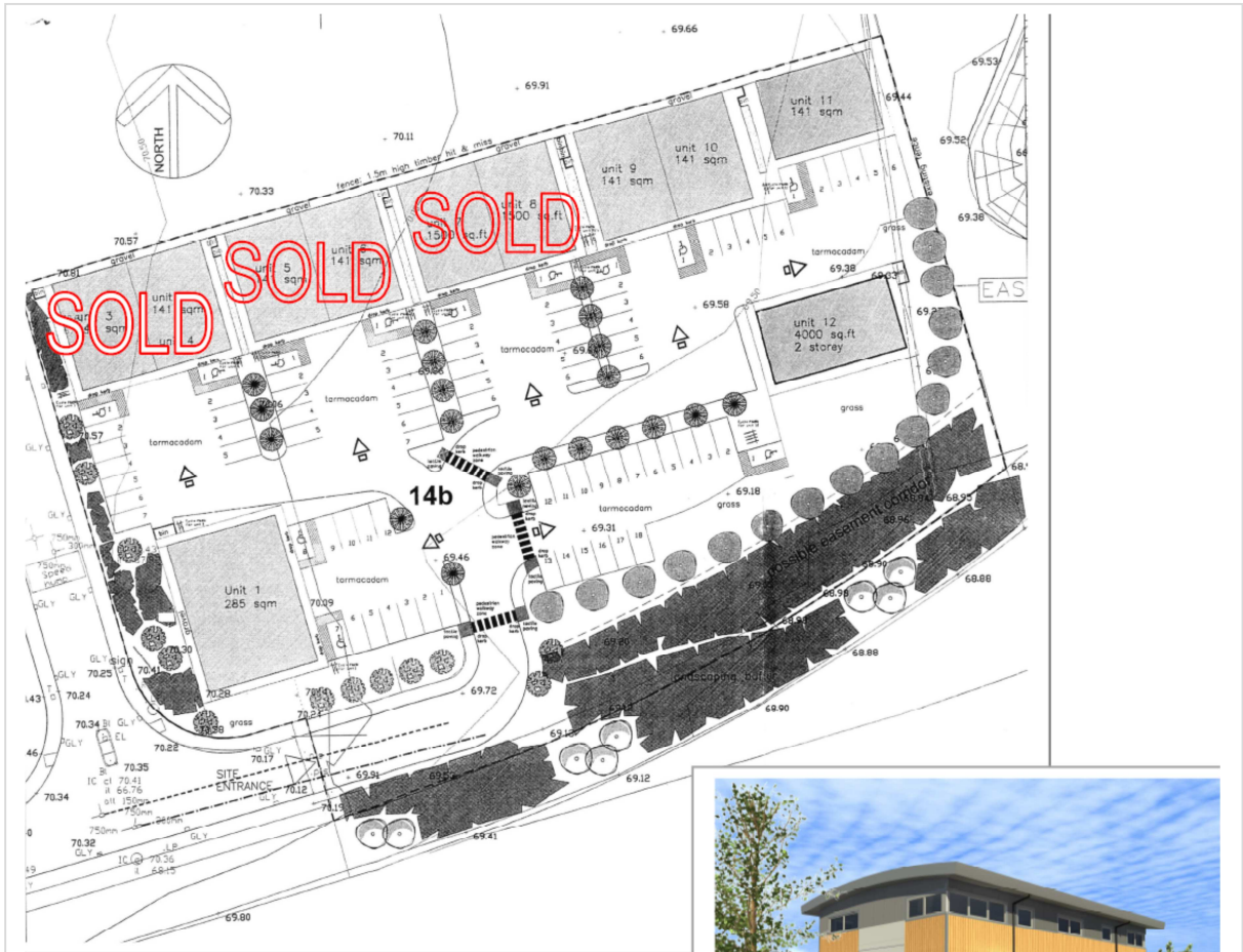
Plans for identification only – not to scale