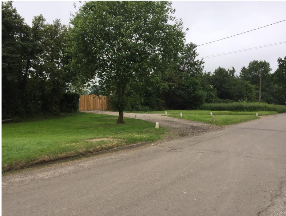
View of the approach from Studham to the north