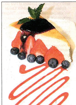
Game-goers, get a free dessert at the Sea Fire Grill and Benjamin Steakhouse.

Desserts free with Super Bowl ticket stubs now through Feb. 2. Sea Fire Grill, 158 E. 48th St.; Benjamin Steakhouse, 52 E. 41st St.