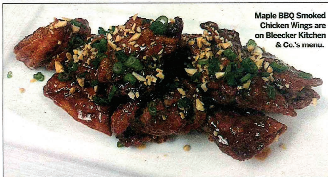
Maple BBQ Smoked Chicken Wings are on Bleecker Kitchen & Co.'s menu.

$45 bucket. Various locations, themeatballshop.com