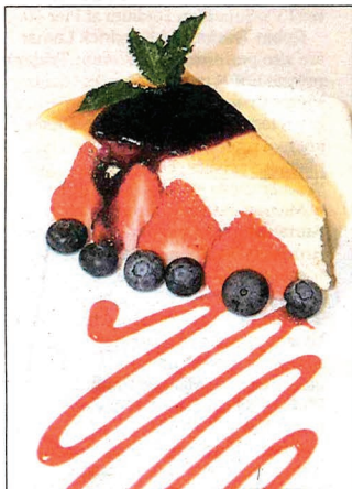
Game-goers, get a free dessert at the Sea Fire Grill and Benjamin Steakhouse.

Desserts free with Super Bowl ticket stubs now through Feb. 2. Sea Fire Grill, 158 E. 48th St.; Benjamin Steakhouse, 52 E. 41st St.