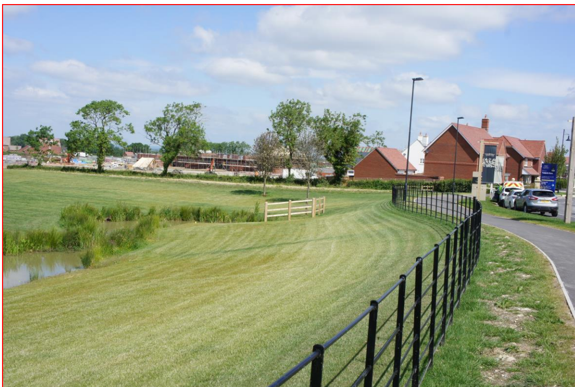
INDICATIVE PHOTOGRAPH ONLY