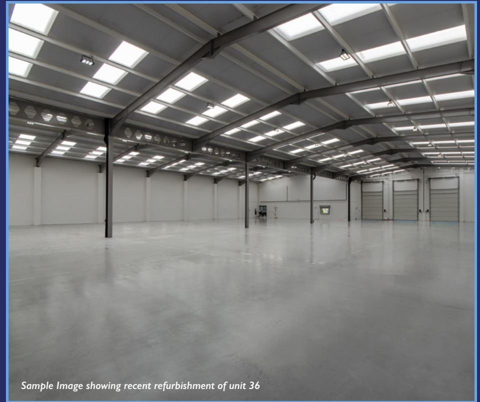
Sample Image showing recent refurbishment of unit 36