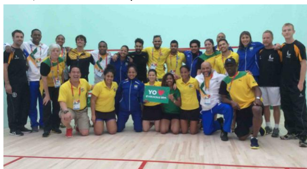
(Pictured: some of the competing countries)