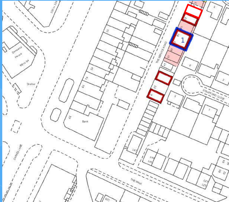
Not to scale