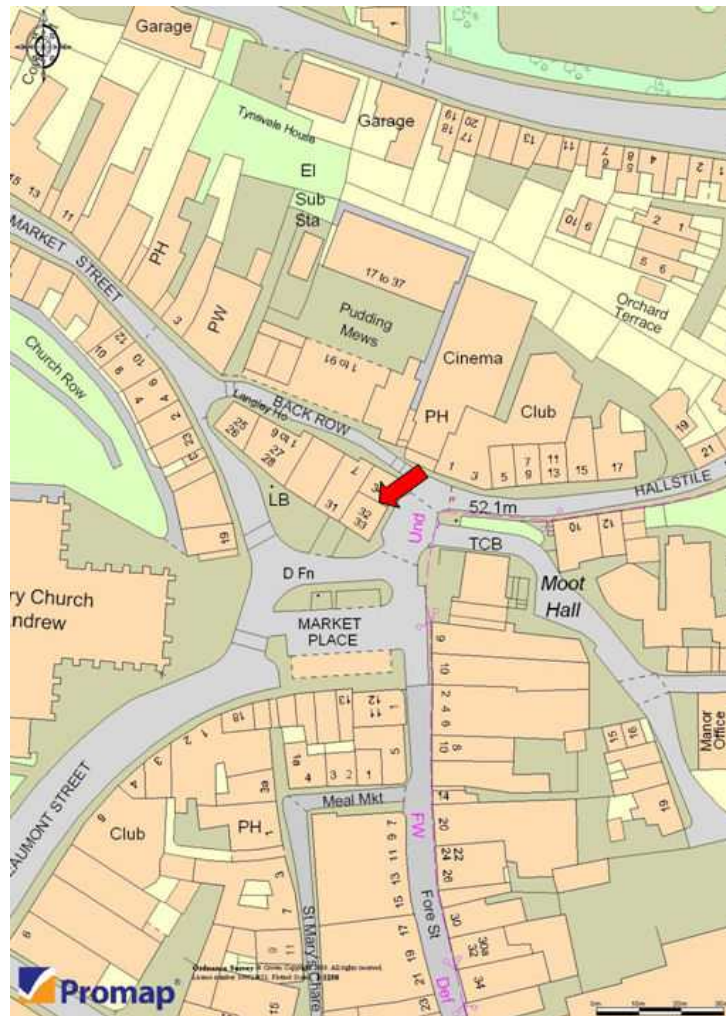
F169 Printed by Ravensworth 01670 713330