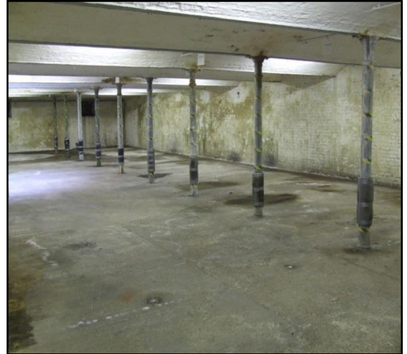
Internal picture of some of the further spaces and storage that Garage No. 4 can offer