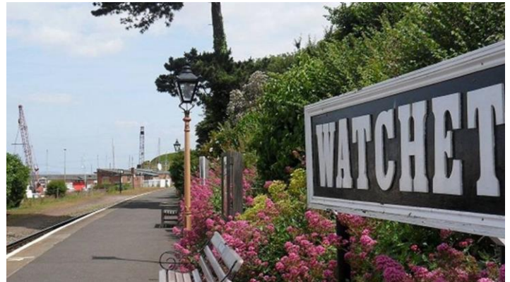
West Somerset Railway – Watchet Station