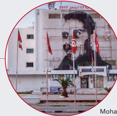
Monument representing Bouazizi's fruit cart in Sidi Bouzid.

Mohamed Bouazizi's face adorns the facade of the local Post Office in Sidi Bouzid.