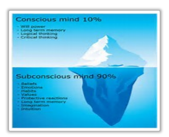
Understanding the Conscious and sub-conscious