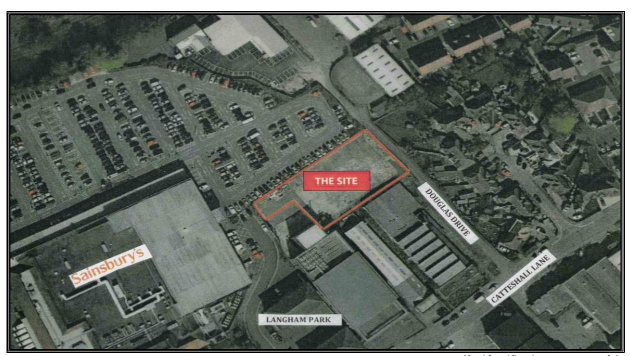
(for identification purposes only)