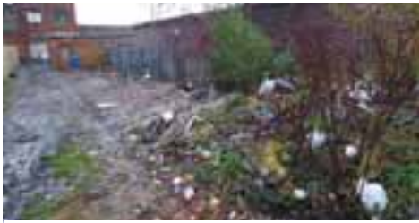
Land Off Kent Street, Oldham