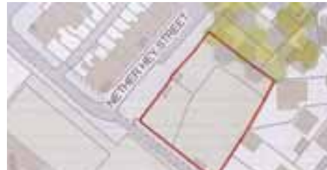
Land Off Netherhey Street, Oldham