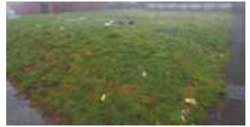
Land At Estate Street, Oldham