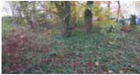
Woodland, Harefield Drive, Heywood