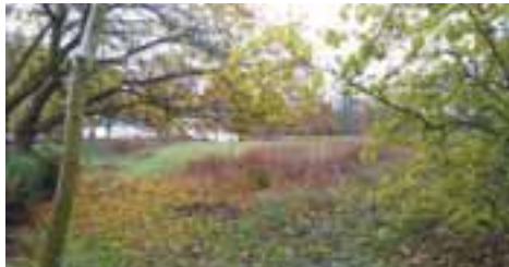
The Paddock, Harefield Drive, Heywood