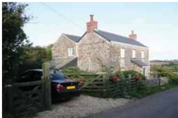
Plain An Gwarry