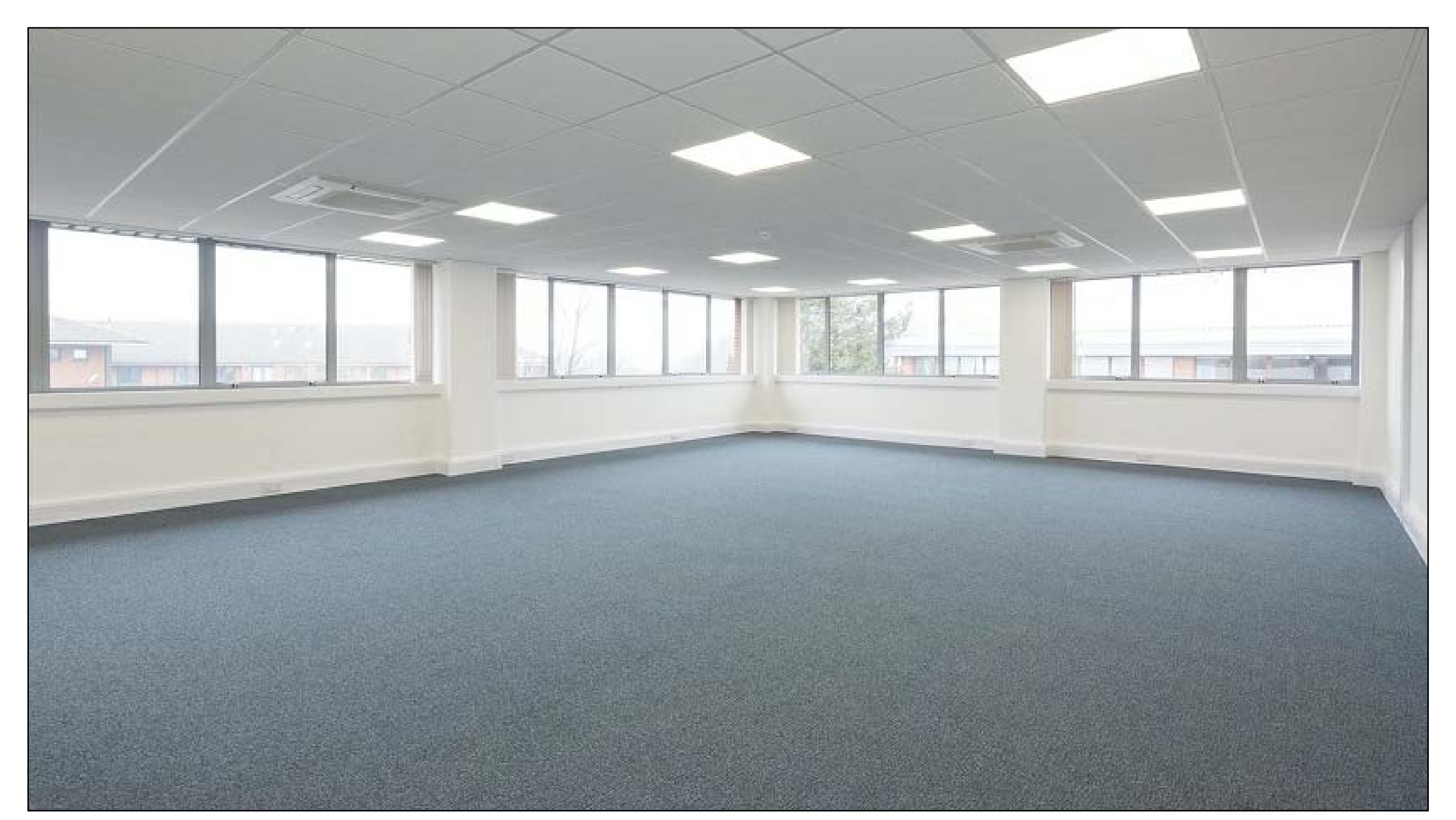
EXISTING FIRST FLOOR VIEW