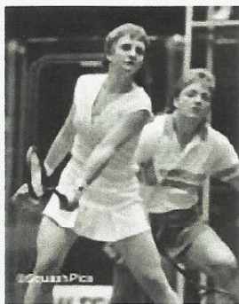
Vicki World Champion

World Champion Visits Our Shores Eastside Squash Centre plays host to the last State Junior Performance Pathway Training Camp for the year and this one ends with a bang. The Mighty Dynamo of Squash, Australia's very own Vicki Cardwell B.E.M. 4 times British Open Winner and World Title winner in 1983 and proudly inducted into the Australian Sport Hall of Fame and the Squash Australia Hall of Fame was one of our guest Coaches and boy did she put us through our paces, it was an honour to have such a world great squash player grace our court with her presence and no doubt we all went away much the squash wiser and with our adrenaline pumping after having such a wonderful champion give us her time.