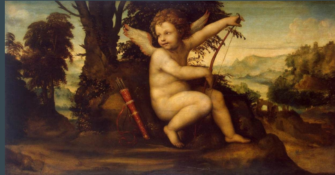
Il Sodoma, Cupid in a Landscape