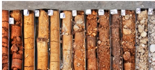
Figure 3: Homogenized soil classification, assessed in accordance with Australian Standard [63]

The challenge of material variation could be addressed by various strategies. By using wood as an example for a natural building material with large variability, we can identify the ways in which we developed both prescriptive and performance standards for timber. While the number of wood species is great, the main strategy used in timber standardization is to group species according to their structural properties and appearances, prescribing uniform grade-use data for each group. Similar to timber codes and standards, a homogenization approach grouping different species or ‘classes’ of clay materials should be developed for earthen materials to ensure adherence with format and objectives of conventional standards.