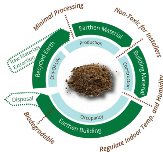
Figure 1: Cradle to cradle life cycle diagram of earth as a building material (edited from Schroeder, 2016)

earthen walls (cob, rammed earth, and light straw clay) and 3 conventional walls (timber frame, insulated and uninsulated concrete block). The functional unit used is 1 square meter of a single-family housing wall, located in warm-hot climates in the US, defined as IECC climate zones 1 through 4 [49]. The system boundaries consider embodied environmental impacts, including the extraction and processing of raw materials, manufacturing, storage, and transporting to the construction site.