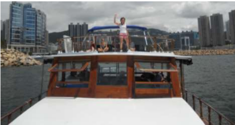
Junk boat in Hong Kong harbour

If you love your squash you should aim to play in a Worlds – it is a great experience! Just pick a location you like and it is a great way to see the world and meet fellow squashies – just like an Australian Championships, but on a bigger scale.