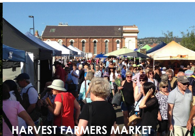
HARVEST FARMERS MARKET