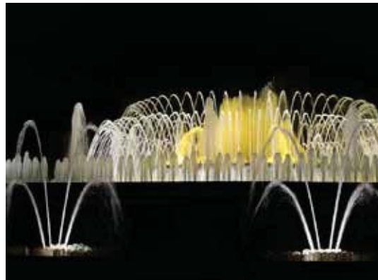
TOP: Each stream of water in the fountain is shot up from below. The force of gravity pulls the water down, forming an arc shape.

Force, motion, gravity, mass, and inertia...these concepts and more govern the world (and our Universe). They are complex ideas but once you understand them, you will see everything a little more clearly.