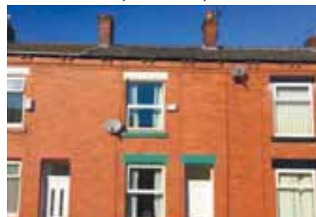
10 Dalton Street, Failsworth Guide Price: £55,000 – £65,000