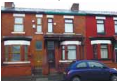
72 Jetson Street, Manchester Guide Price: £65,000 plus