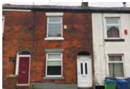
8 Newman Road, Rochdale Guide Price: £45,000 – £55,000