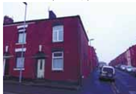
113 Napier Street East, Oldham Guide Price: £35,000 – £45,000