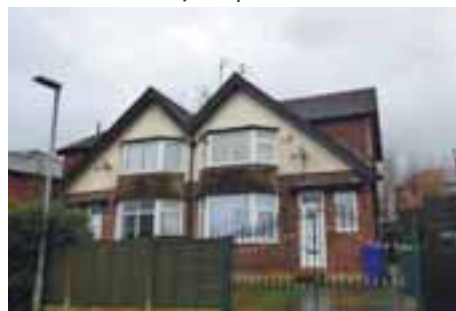
20 Holyrood Road, Prestwich Guide Price: £110,000 plus