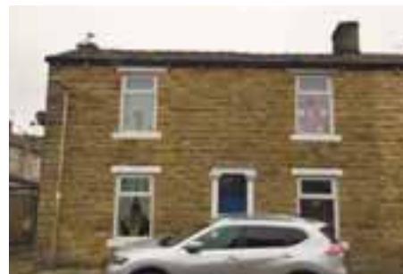
8 Oak Street, Oswaldtwistle Guide Price: £25,000 – £35,000