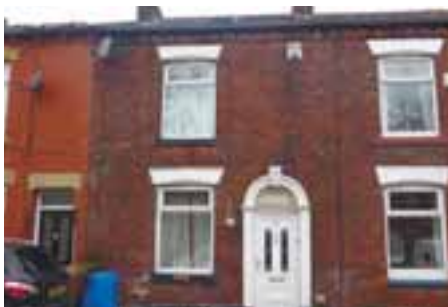
64 Albert Street, Royton Guide Price: £60,000 – £70,000