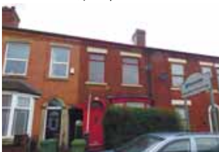
34 Cheetham Hill Road, Salford Guide Price: £85,000 plus