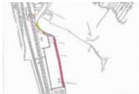
Land at Station Road, Coppull Guide Price: £10,000 – £20,000