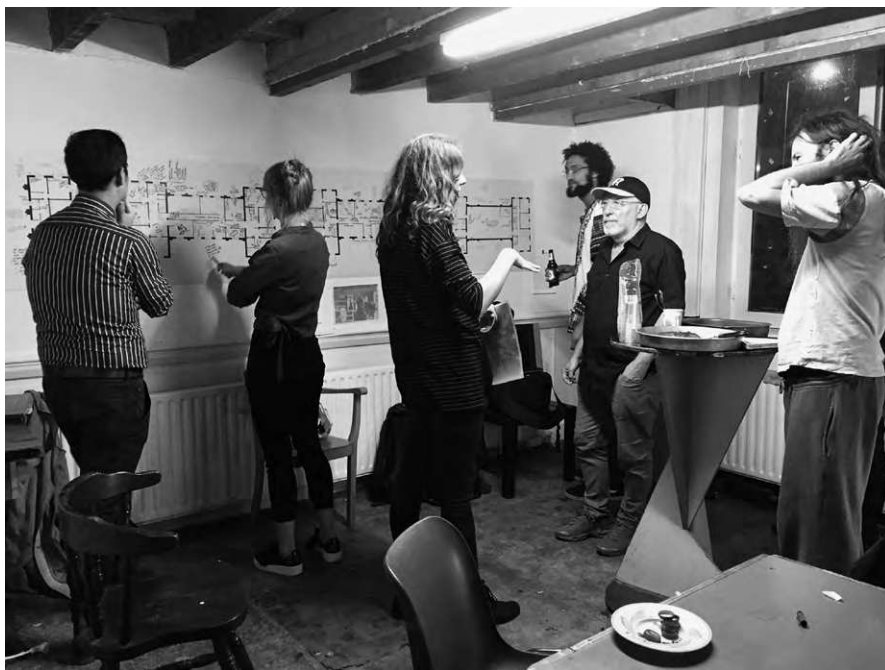
1 The first annotation session at Poortgebouw in Rotterdam, September 2017