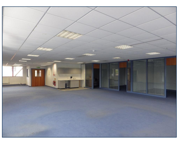
FIRST FLOOR OFFICES, UNIT 1 NORTHGATE, HAMPSHIRE INTERNATIONAL BUSINESS PARK, CROCKFORD LANE, BASINGSTOKE, RG24 8WH