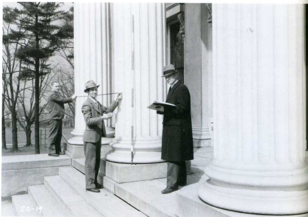
Figure 196 Architects measuring dimensions at Kentucky School for the Blind, Louisville, 1934

Committee on the Preservation of Historic Buildings. 13 Holland deployed the AIA's organizational structure of regional chapters to provide district officers and recruit architects for HABS. He also set up a standardized system to receive the thousands of drawings and photographs they produced and to archive them in the Library of Congress. The 1935 Historic Sites Act made HABS a permanent program of the National Park Service, providing a steady if modest source of income to its architects and stimulating interest in old buildings among architects across the nation. In many ways HABS may be considered a precursor to university programs in preservation, as it provided the first organized courses in preservation on a national scale. Figure 196