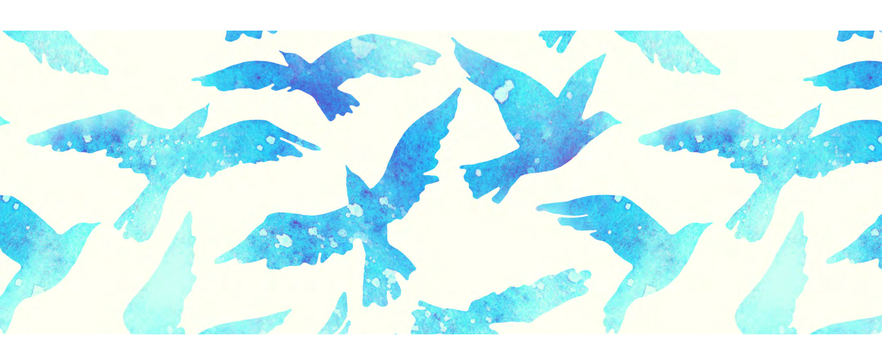
Have you ever felt this way?

But he said to me, "My grace is sufficient for you, for my power is made perfect in weakness." Therefore I will boast all the more gladly about my weaknesses, so that Christ's power may rest on me. 2 Corinthians 12:9