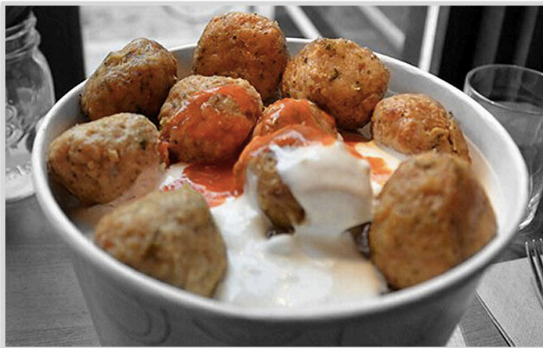
Bucket of meatballs at The Meatball Shop

While everyone else's Super Bowl parties on Feb. 2, 2014, might have microwave nachos and from-the-jar salsa, any self-respecting New York food and sports lover will be pulling out all the stops for a day with such snacking potential. Thankfully any number of excellent NYC restaurants will help you with that, ensuring that your Super Bowl spread vies for attention with the game itself. Massive hero sandwiches with a side of meatballs? We've found 'em. Restaurant-quality tacos and margaritas? Absolutely. Deep-fried wings to blow all other wings out of the stadium? We've got those, too. Behold our top eight spots to source Super Bowl snacks that go well beyond a bag of potato chips. Make sure to set up your order ahead of time as it's gonna be a busy day — and these amazing feasts take some prep time.