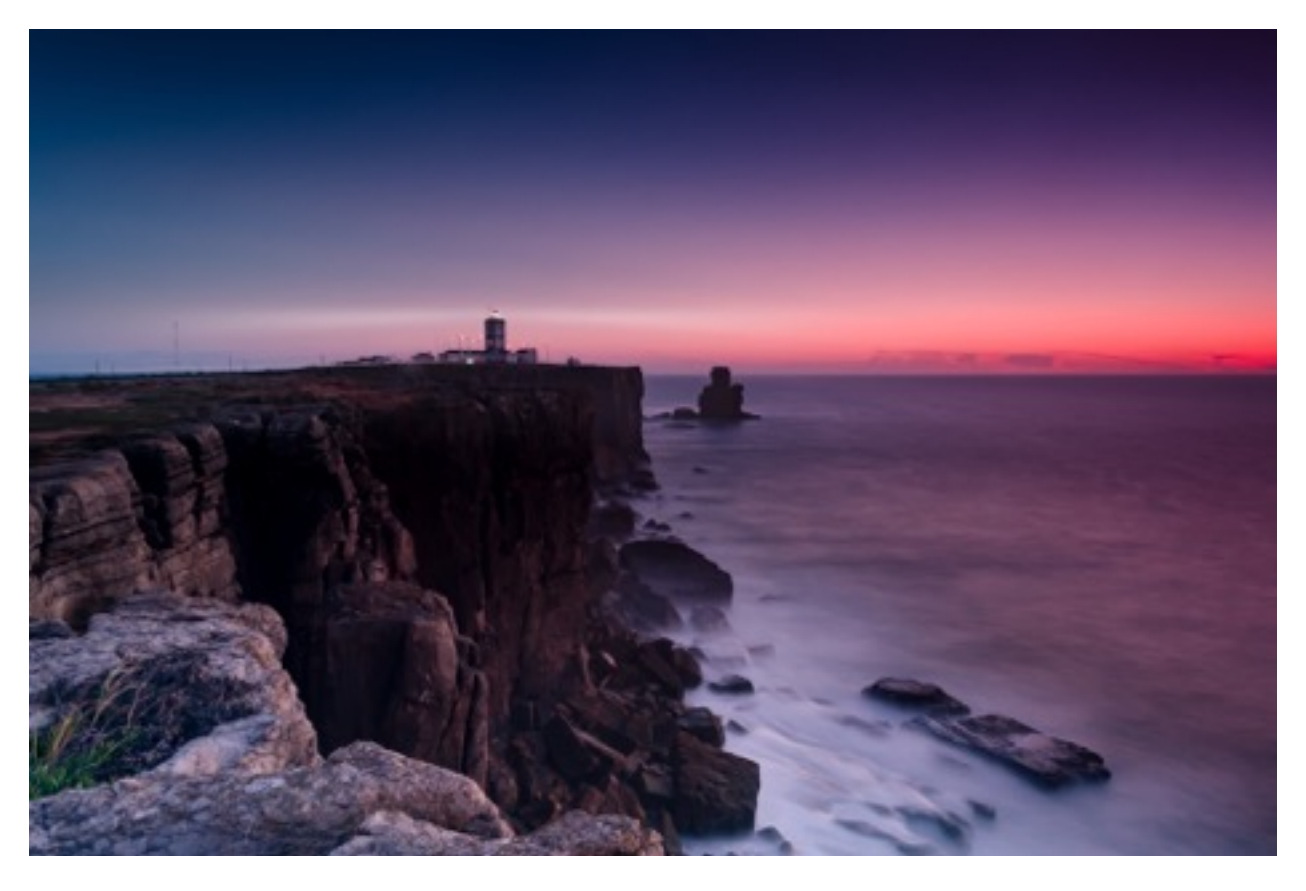
"And what I say unto you I say unto all, Watch" (13:37).

Jesus alerts everyone (for all time) to be watchful. Let's see why!