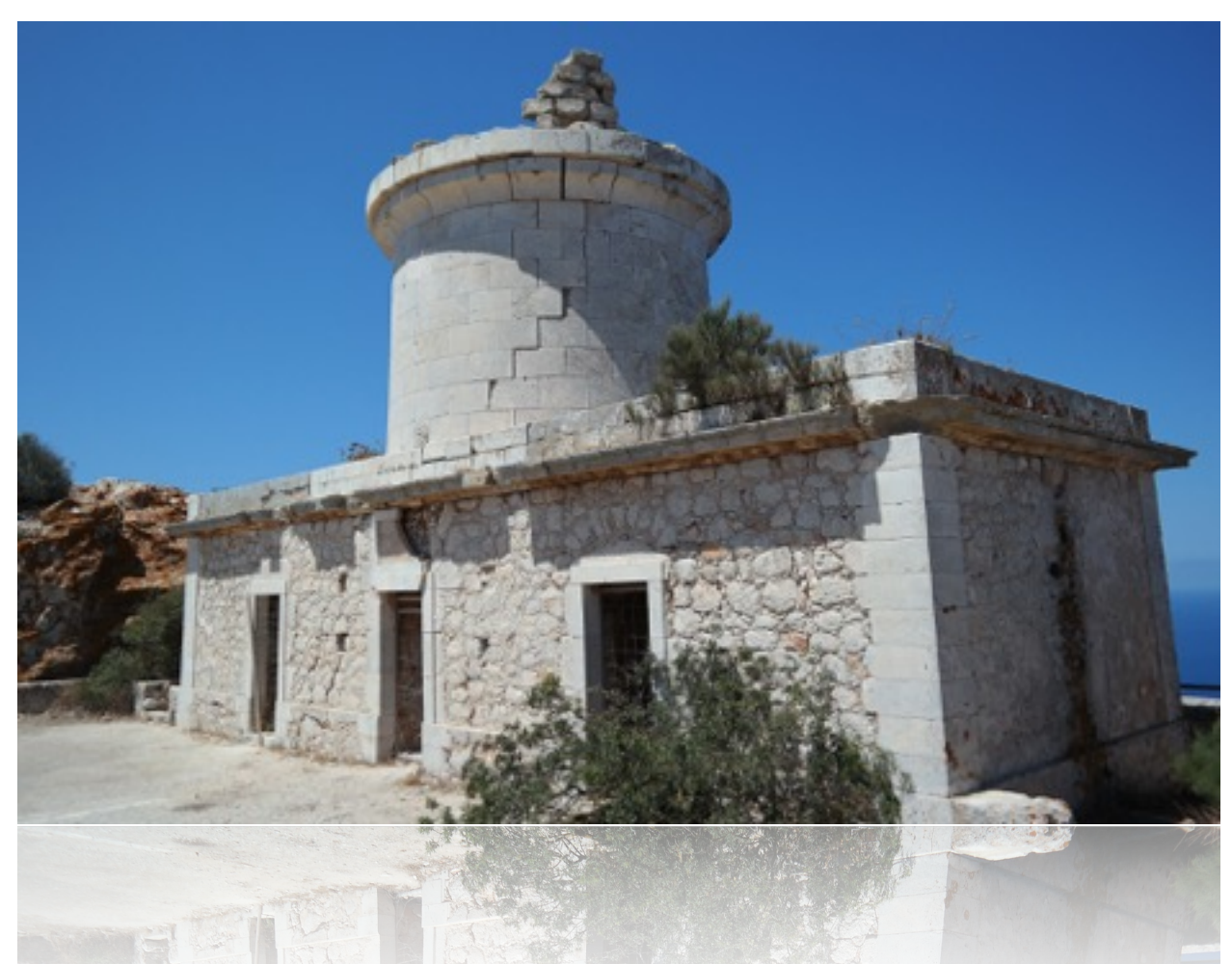
<u>Watchtower</u>. A tower on which a sentinel is placed to watch for enemies or the approach of danger ( Webster's 1828 ).

We must watch — be alert — that our consciousness remains pure, spiritual, and on course. We must watch that suggestions of evil, threat, material and personal loss, and so forth, do not pull us away from our mission and God-given work. Jesus has already instructed his disciples, and instructed us, his present day disciples, to take up the cross. This is not an easy thing. We must have tremendously focused purpose and love.