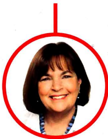
Ina's CRANBERRY SCONES