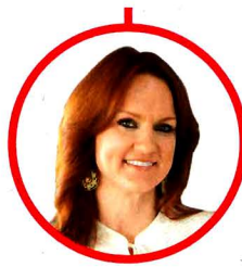
Ree's PRIME RIB ROAST