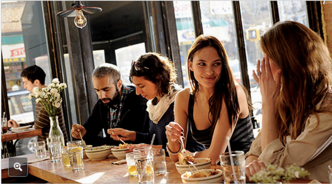
At the Meatball Shop on the Lower East Side, a childhood favorite is attracting crowds.

84 Stanton Street (Allen Street), Lower East Side, (212) 982-8895, themeatballshop.com .