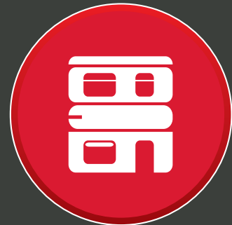
Mixed Use Properties