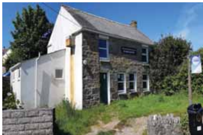
Lot 1 Stithans Parish Institute including two snooker tables