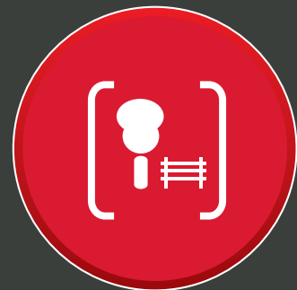
Amenity Land & Other Property

Visit our website for more information on why Auction is the best option for your property