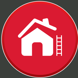
Properties for Improvement