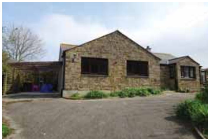
Lot 6 Aspen Gardens with 4.2 acres of land