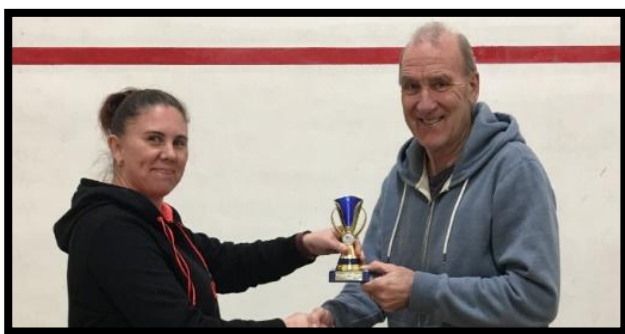
L-R: Elisha Mitchell, Gerard Hall