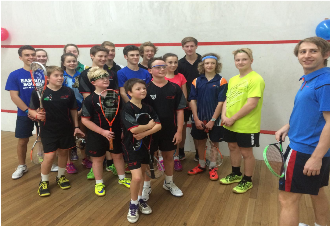
You have our full attention