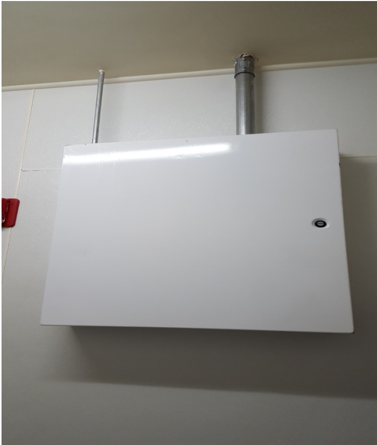
PICs Nema behind the Wall of Eyes