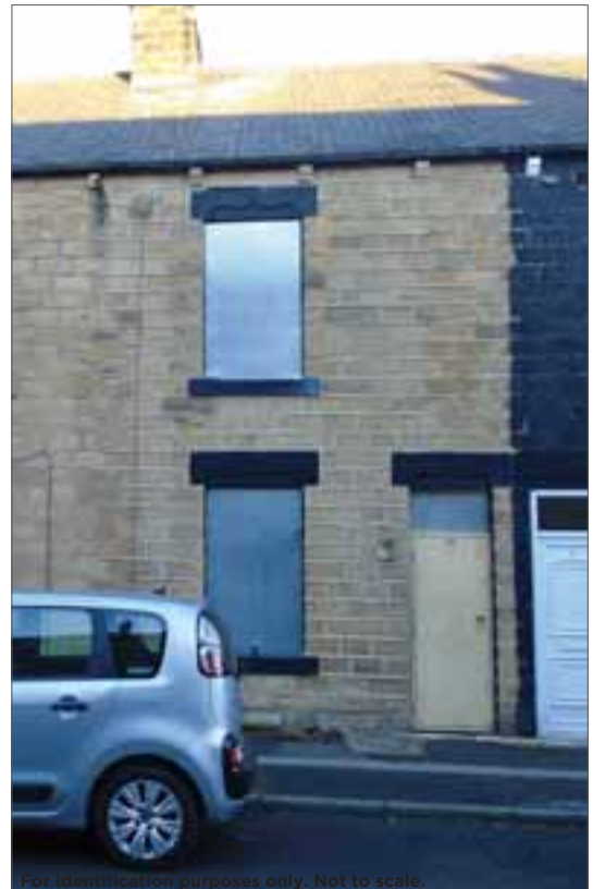
For identification purposes only. Not to scale.