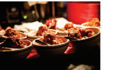
Spicy Beef Balls with spicy meat sauce