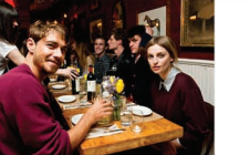
Grace Indulgence models who model in the Band of Outsiders show earlier tonight