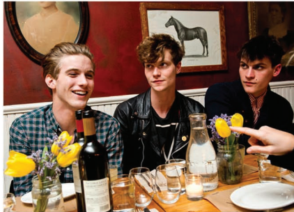
Those Band of Outsiders models are totally about to eat some ice cream sandwiches

3:34 PM / FEBRUARY 12, 2012 / POSTED BY Sam Dean FILED UNDER: Events