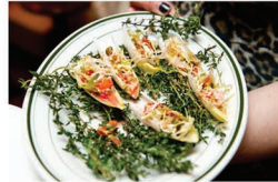
Endive, fennel, blood orange and pistachio salad