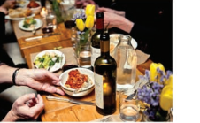
The setting was great and the food was fairly tasty