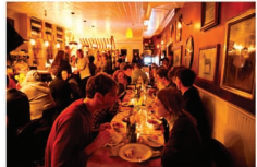
A shot of the packed and cozy Meatball Shop, dinner in full swing