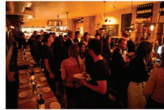
Cordial hour setting