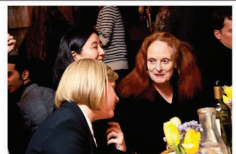
Vogue Creative Director Grace Coddington