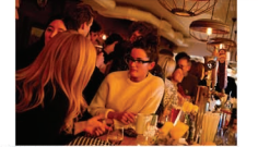
Equipped with bags of organic and sustainable, the party goes on