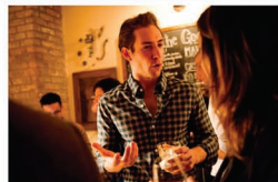
Dewar's Sour in a bowl, a point is elucidated