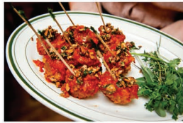
Mini Compagnie meatballs with salsa piquita made the rounds during cocktail hour