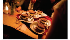
Dessert - chocolate chip cookies and mini ice cream sandwiches (there were waterbreads and vanilla ones, too)