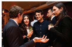
The Dewar's Sour: Middle 3/4 fresh mint leaves, combine 2 parts Dewar's 12yr Blended Scotch Whisky, 3/4 part simple syrup, and 1 part fresh squeezed lemon juice. Shake and strain into a Collins glass filled with crushed ice. Top with club soda and garnish with fresh mint leaves.