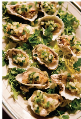
Koshi oyster sliders with fennel, cucumber and citrus