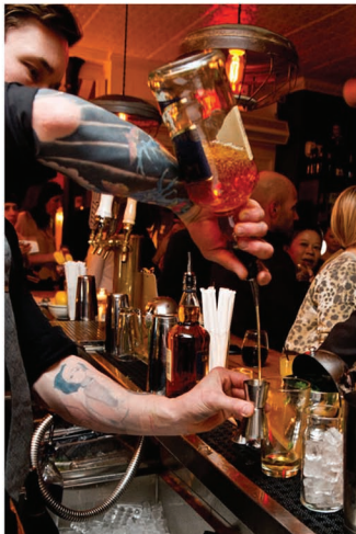
The Dewar's Sour: Combine 2 parts Dewar's 12yr Blended Scotch Whisky, 3/4 parts simple syrup, and 1 part fresh squeezed lemon juice in a shaker with ice. Shake and strain into a rocks glass with ice. Garnish with an orange twist.