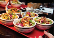
Of course it wasn't all pork and pasta - Market Salad topped in hot glaze braised greens, roasted peppers, and even more organic kale with fresh mint leaves