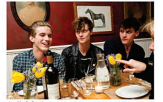
Photograph guests waiting for dessert