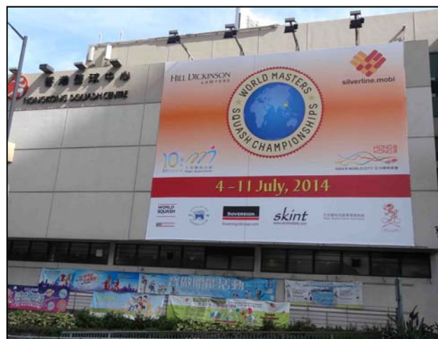
The impressive poster outside the Hong Kong Squash Centre

Whilst the South African Grainger family could walk away with three of the trophies, Australians are expected to take the lion's share of the titles on offer in this month's WSF World Masters Squash Championships, co-sponsored by Hill Dickinson Lawyers and Silverline Mobile, in Hong Kong, according to the seedings announced by WSF.