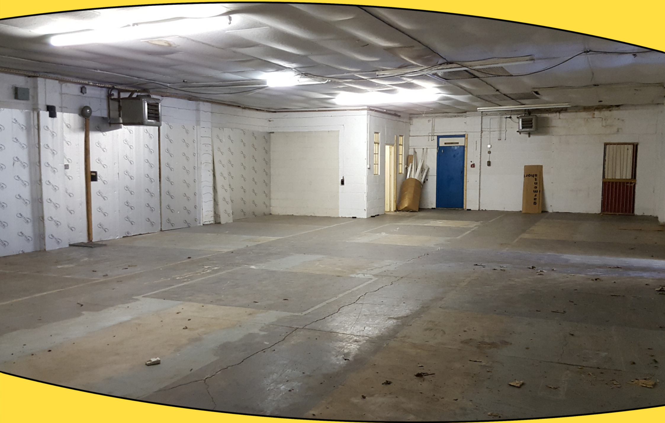
Loveridge Yard, Higher Merley Lane, Corfe Mullen, Wimborne, BH21 3EG