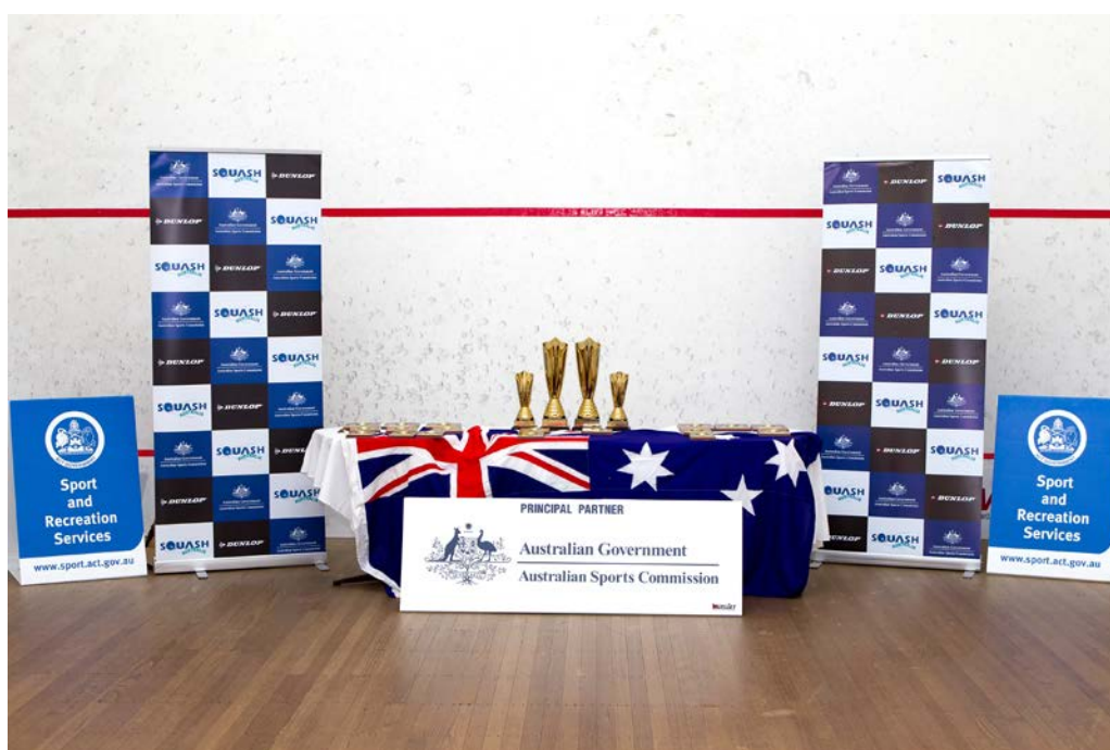
Trophies & Partner Signage at the Australian Junior Open 2012