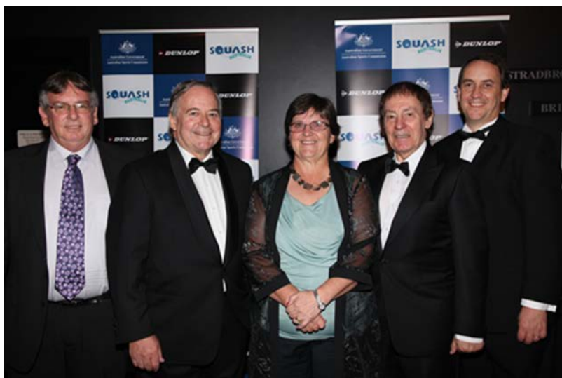
Squash Australia Board at the 2012 Annual Awards Dinner