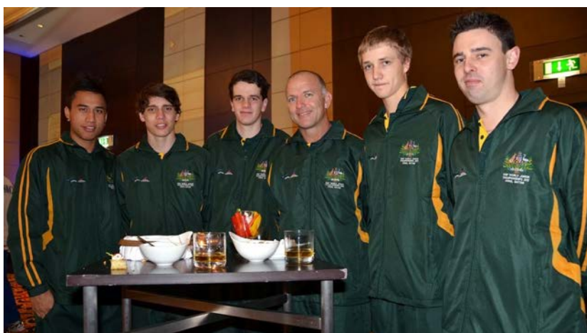
Australian Squad at the WSF World Junior Men's Team Championship 2012