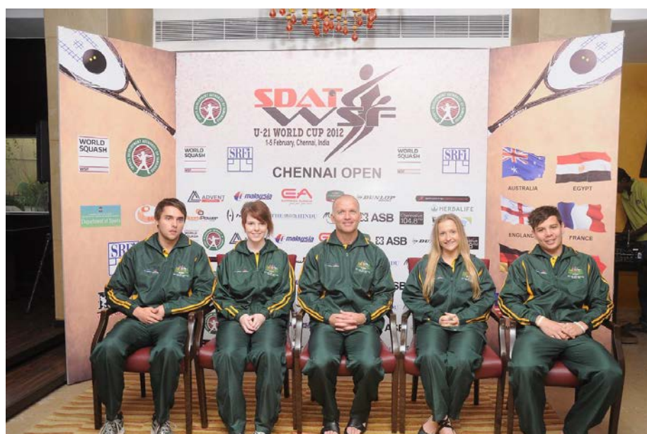
Australian Squad at the WSF Under 21 World Cup 2012