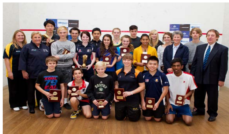
Top Left: Winners & Runners Up at the Australian Junior Open 2012