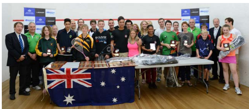
Top Left: Supporters at the Australian Junior Championships 2012