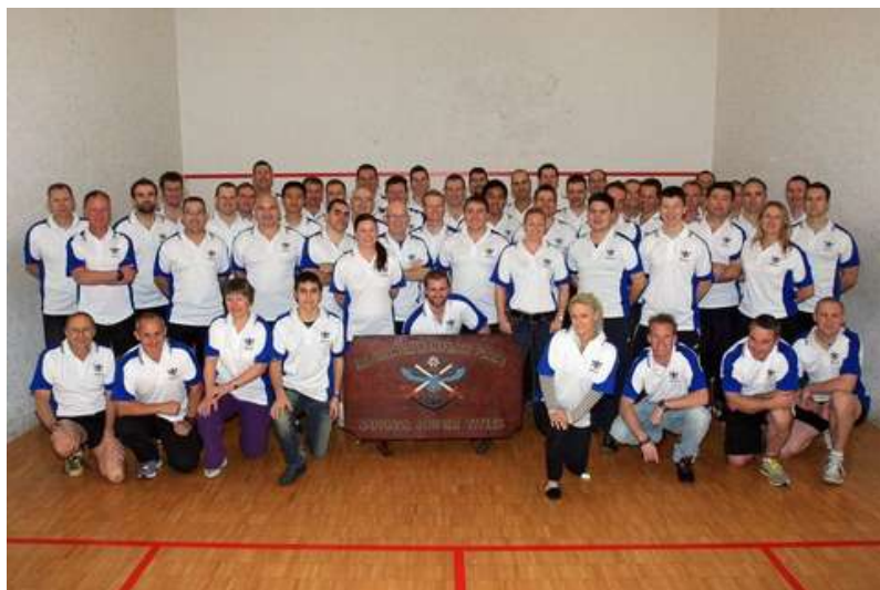
Defence Squash Nationals Tournament – RAAF Williamtown 5-10 Aug 2012