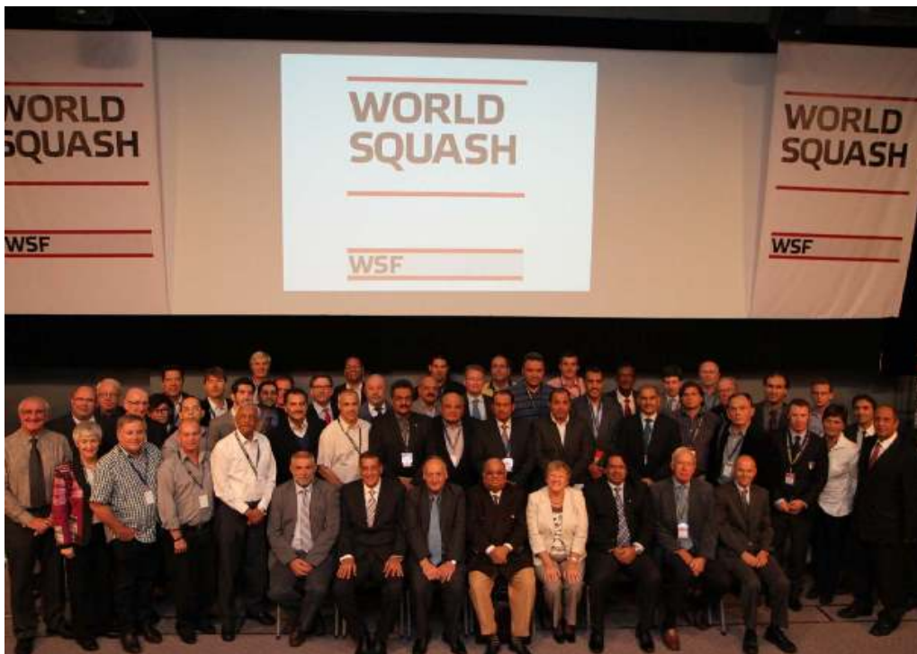
WSF AGM 2012 Presidents