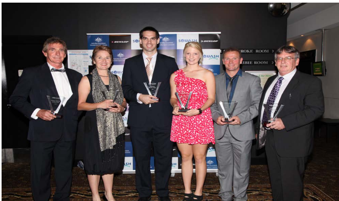
Award winners at the Annual Awards Dinner 2012