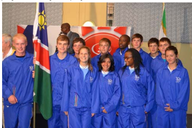
(Namibian Juniors look forward to competing)

Before the Junior Men's Team Championship gets underway in Namibian capital Windhoek from 16 – 21 August are the male and female individual events, on 10 – 15 August. Entry forms will be published in March and sent to all member Federations. (Entries can only be made by Federations on behalf of the players, not by the players themselves).