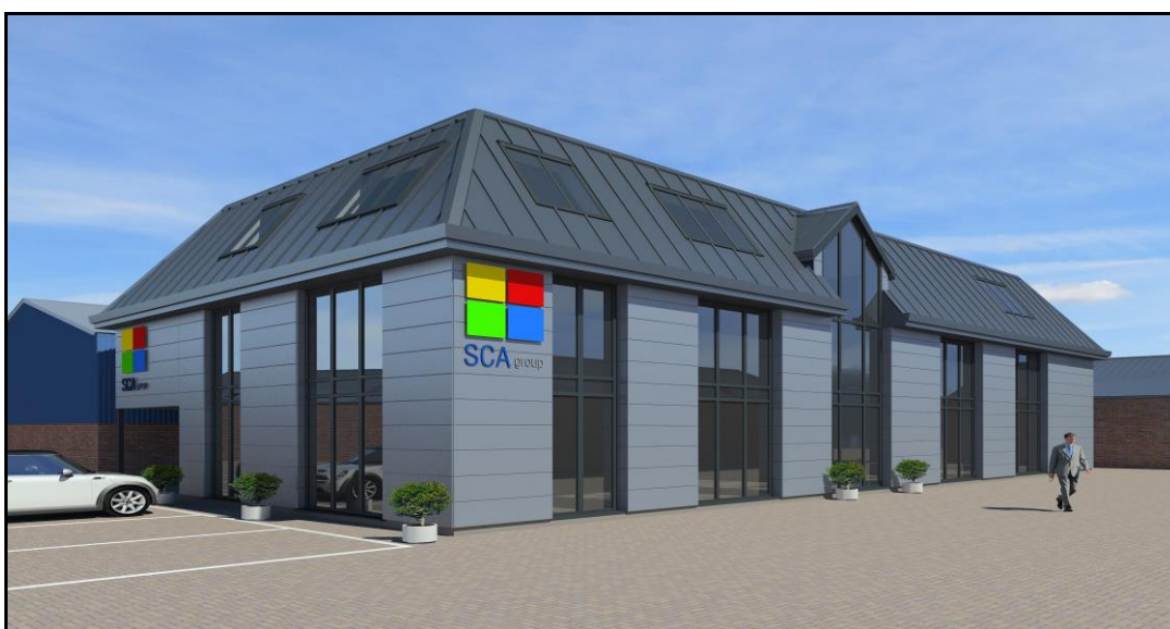
To be constructed (completion Autumn 2018)

SCA House 7 Crane Way Woolsbridge Industrial Estate Three Legged Cross Wimborne BH21 6FA