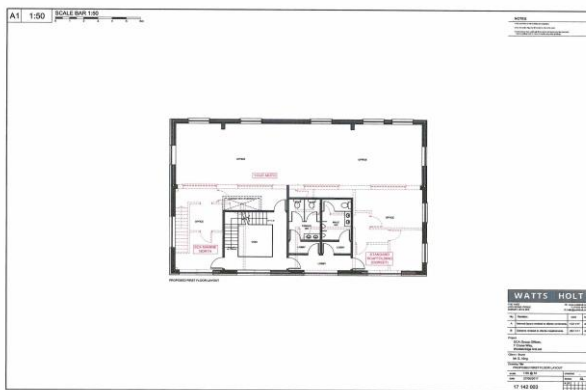
Proposed ground floor elevations